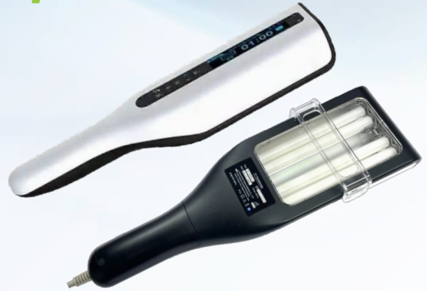
Two-Lamp Handheld KN-4006BL1S

Good for a few small spots or distributed small spots. In some cases can be used on the scalp. Good for very curved skin surfaces such as arms and legs.